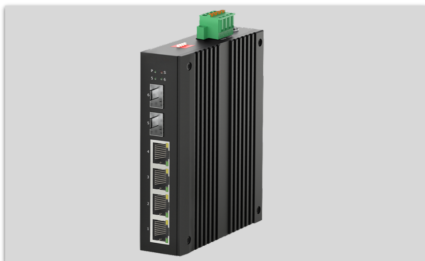
6-port Unmanaged Industrial PoE Switch