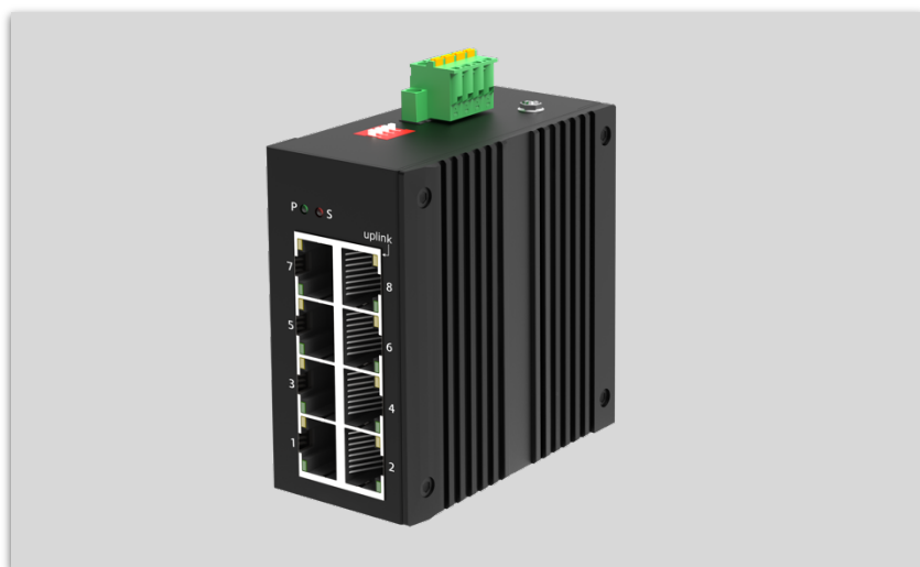
8-port Unmanaged Industrial PoE Switch