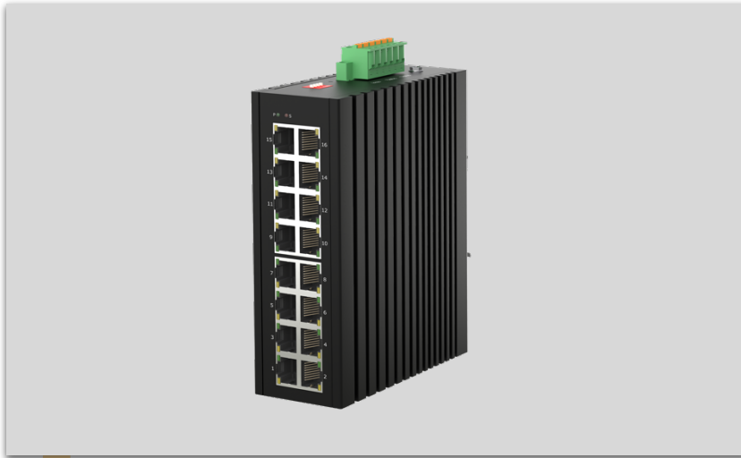
16-port Unmanaged Industrial PoE Switch