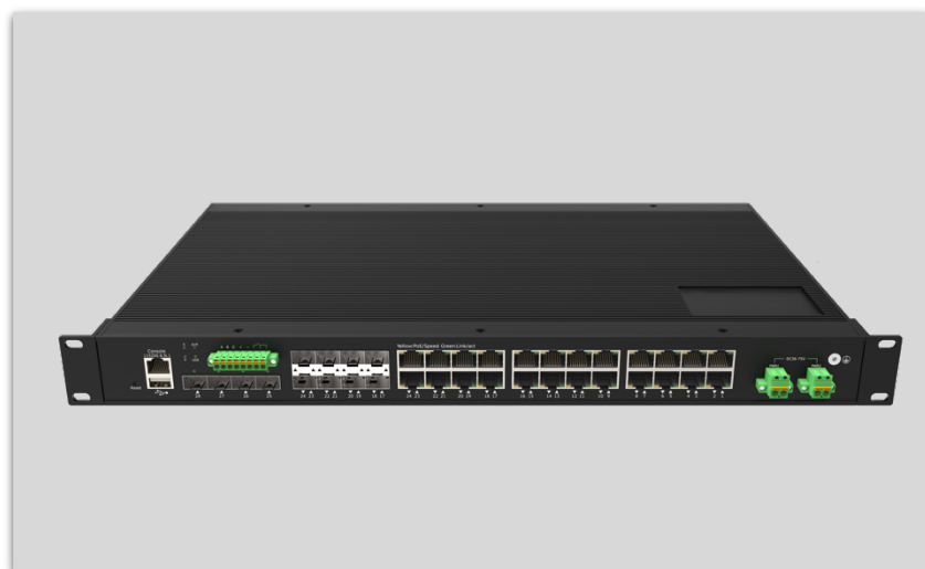
28-port L3 Aggregation Industrial Switch